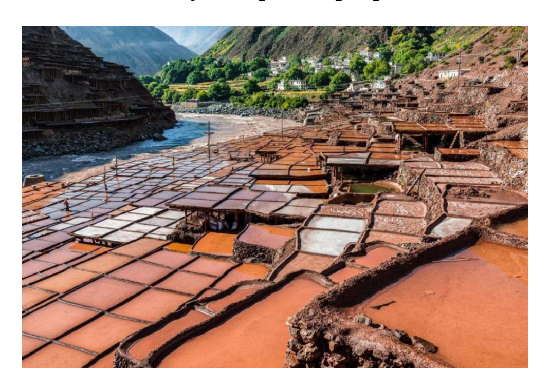
Day 3 Shangrila-Mangkang

8-hour Jeepride to Mangkang with visiting the observatory to the Mt. Kawagebo in Deqin. In Mangkang visiting a local salt mine, once the most important salt production place of Tibet in the history.