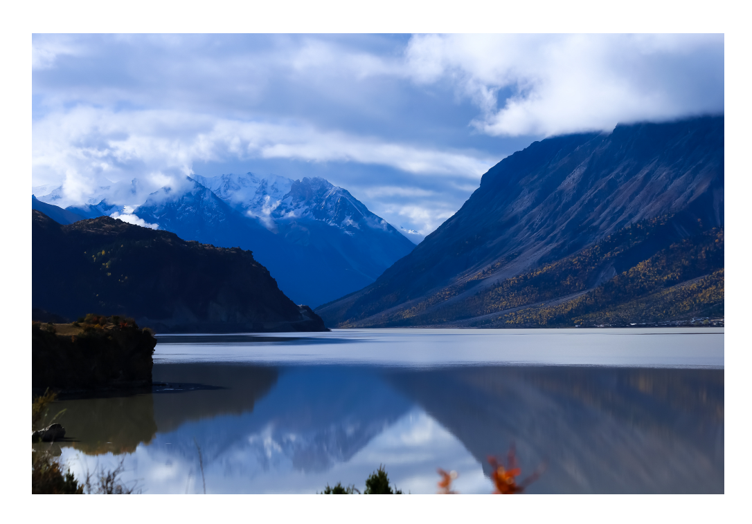
Day 5 Basu-Bomi

4-hour jeepride to Bomi, en route visiting the Rawu Lake.