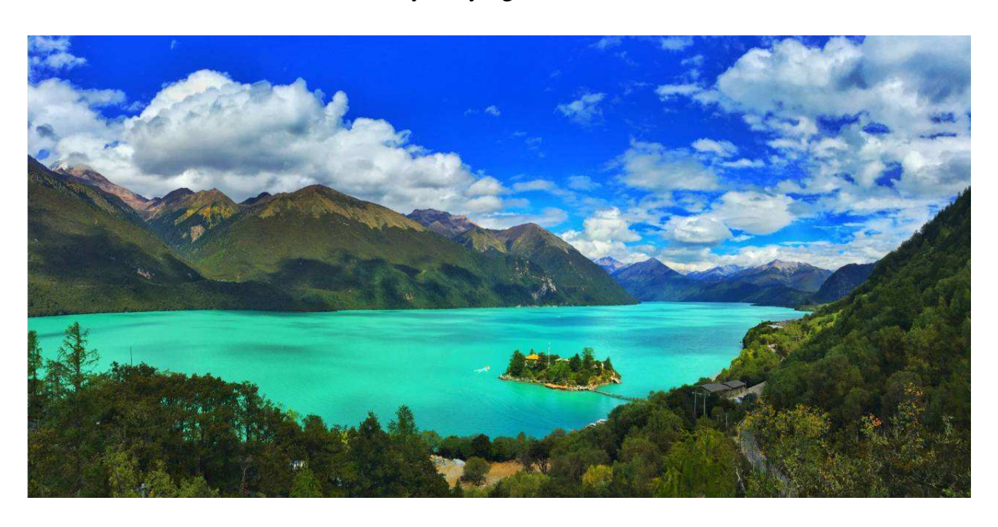
8-hour Jeepride to Lhasa, enroute visiting the Basongtso Lake.