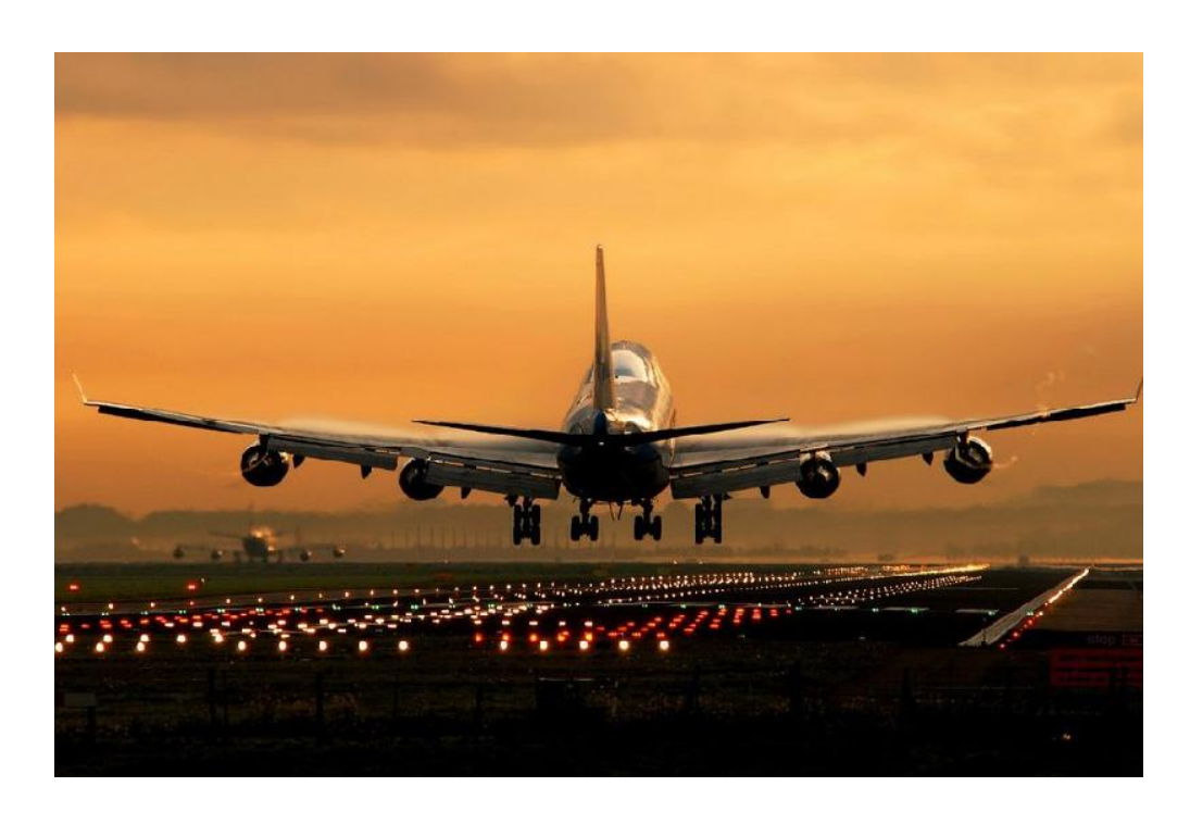
Transfer to airport. Depart or extended stay in Tibet.