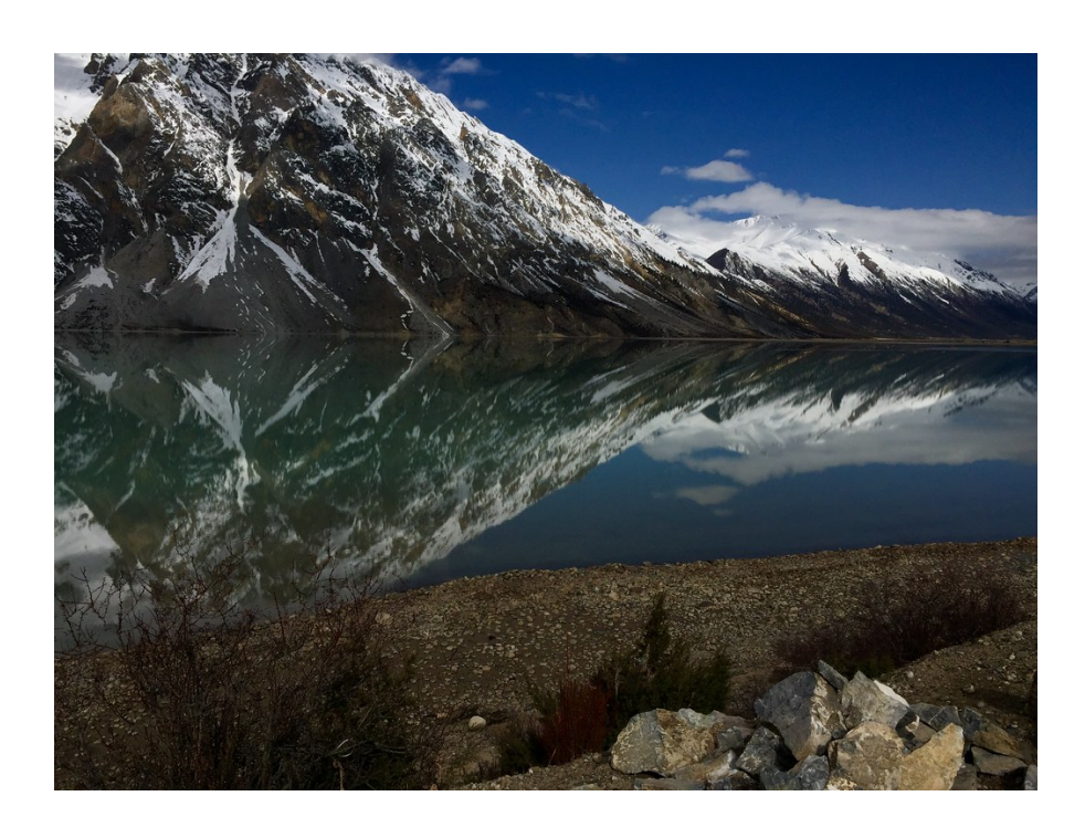
Day 4 Mangkang-Basu

8-hour Jeepride to Basu across 2 rivers: the Meking and the Saalween.